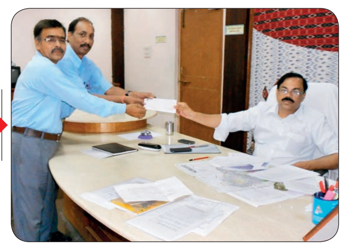
Contribution from DCL to District Collector, Nalgonda towards welfare activities under 'Mana Kosam Manam' scheme initiated by the Collector