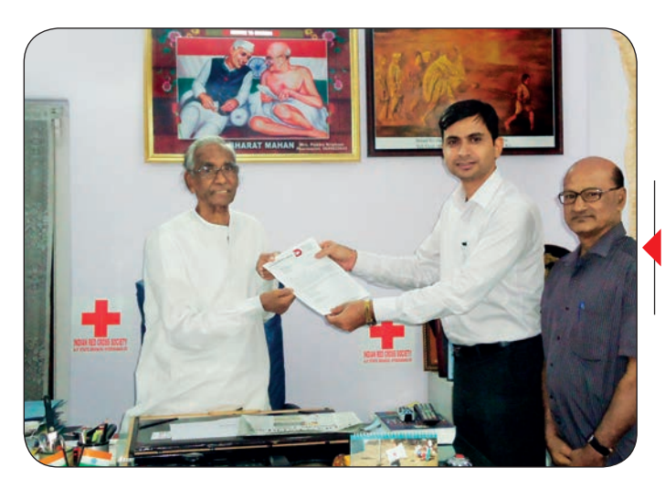
Donation received by Chairman Indian Red Cross Society, A.P. State Branch from DCL and its employees towards Uttarakhand Flood Relief Operations